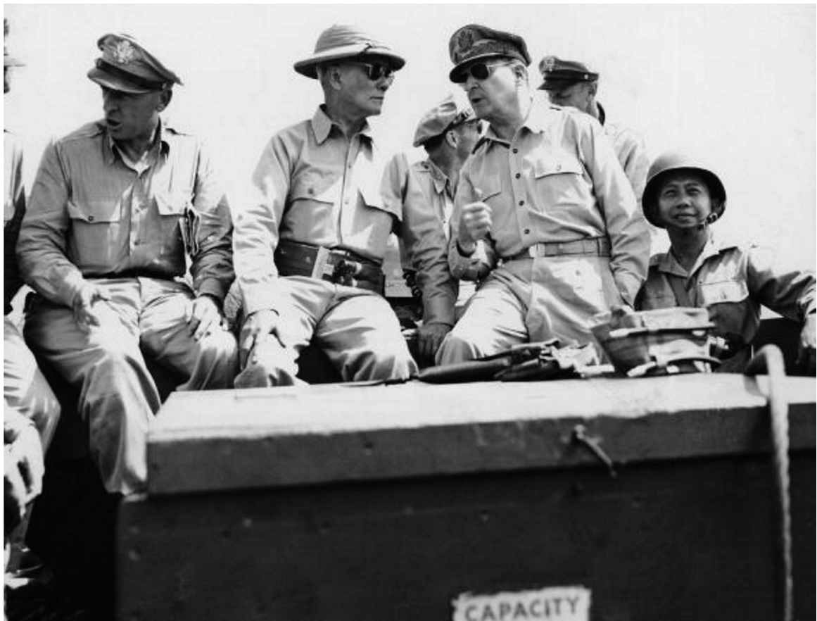
President Sergio Osmeña, General Douglas MacArthur, and Brigadier General Carlos P. Romulo, Leyte.